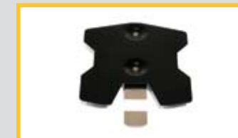
SMRT Charger Mounting Bracket

Stryker advocates disposal of all nonfunctional batteries at a battery recycling center such as the RBRC ( www.rbrc.org ). Made in the U.S.A.