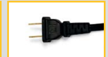
120V AC NEMA Type—North American