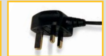
230V AC—United Kingdom