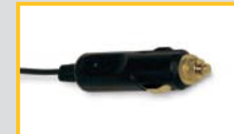
12V DC SAE Type (Automotive)